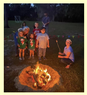
S'Mores at the Bonfire