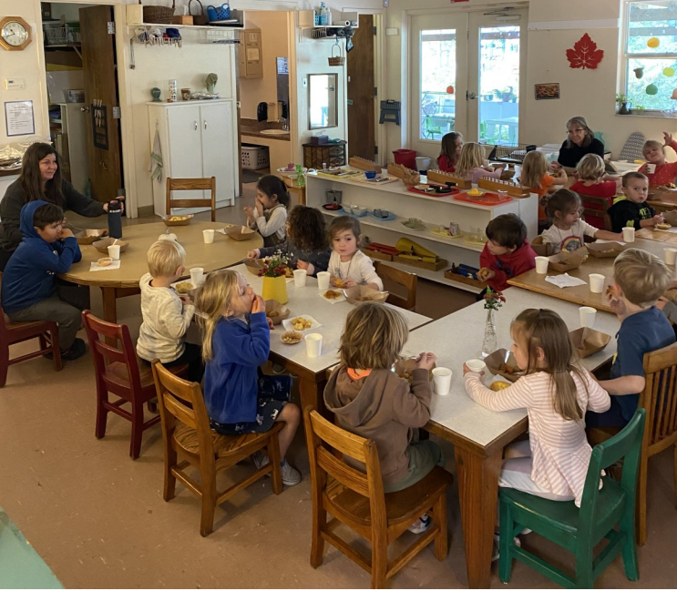
The Thanksgiving Feast