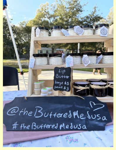
Parent and Student Vendors