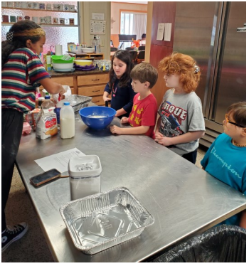
The preparation for, and enjoying, the Thanksgiving Feast