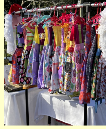
Vendors from the DeLand Area Community