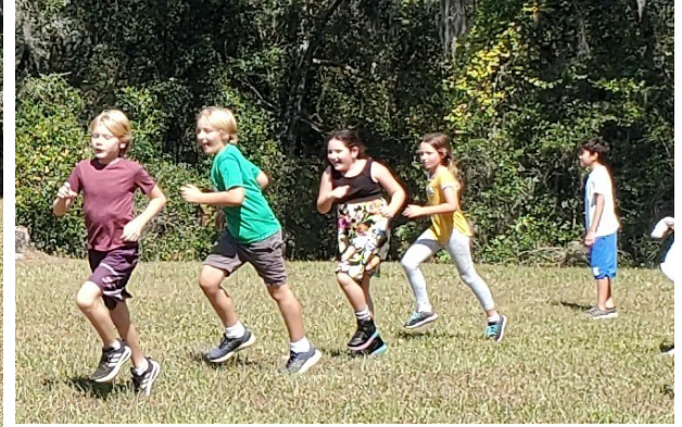
The daily soccer game.