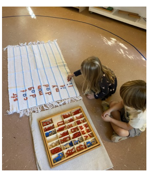
The Moveable Alphabet